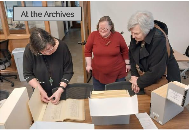
At the Archives