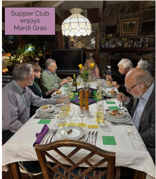
Supper Club enjoys Mardi Gras